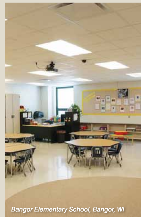
Bangor Elementary School, Bangor, WI