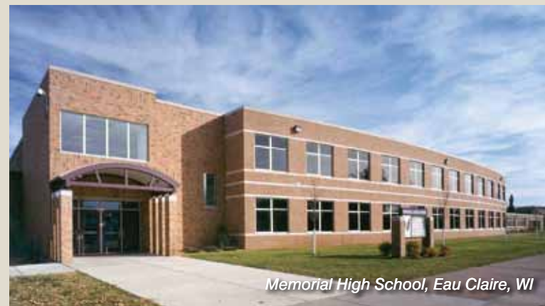
Memorial High School, Eau Claire, WI