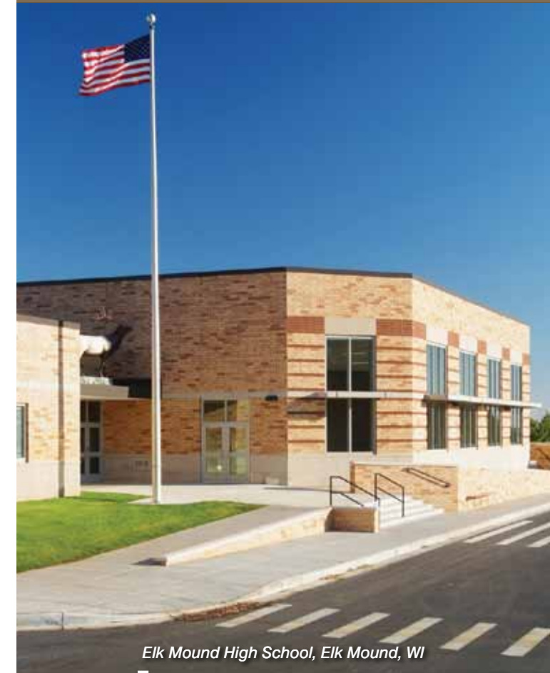
Elk Mound High School, Elk Mound, WI