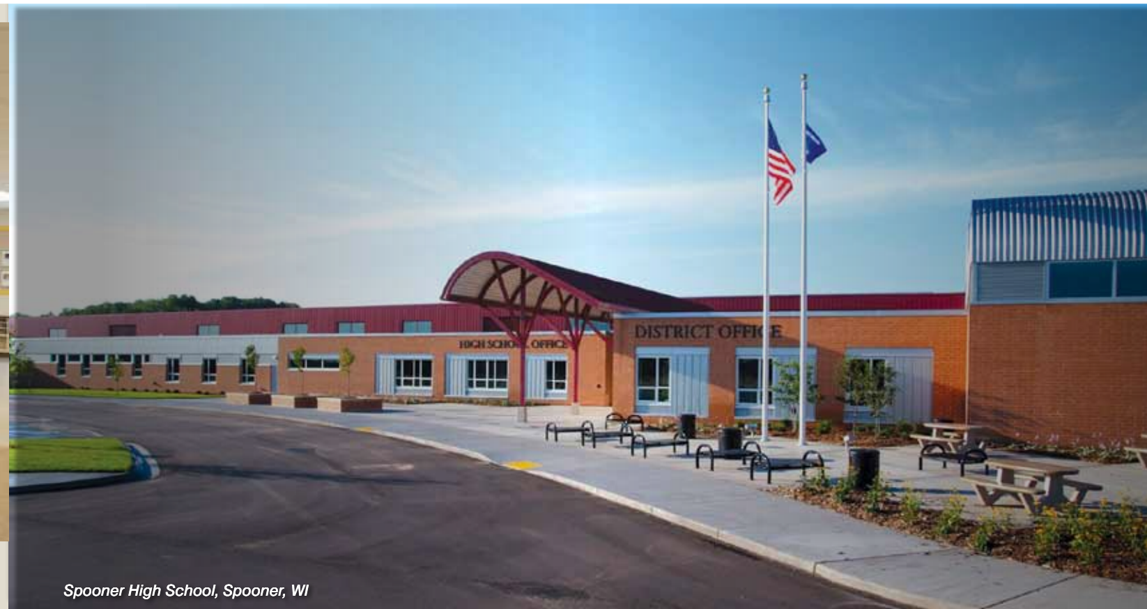
Spooner High School, Spooner, WI