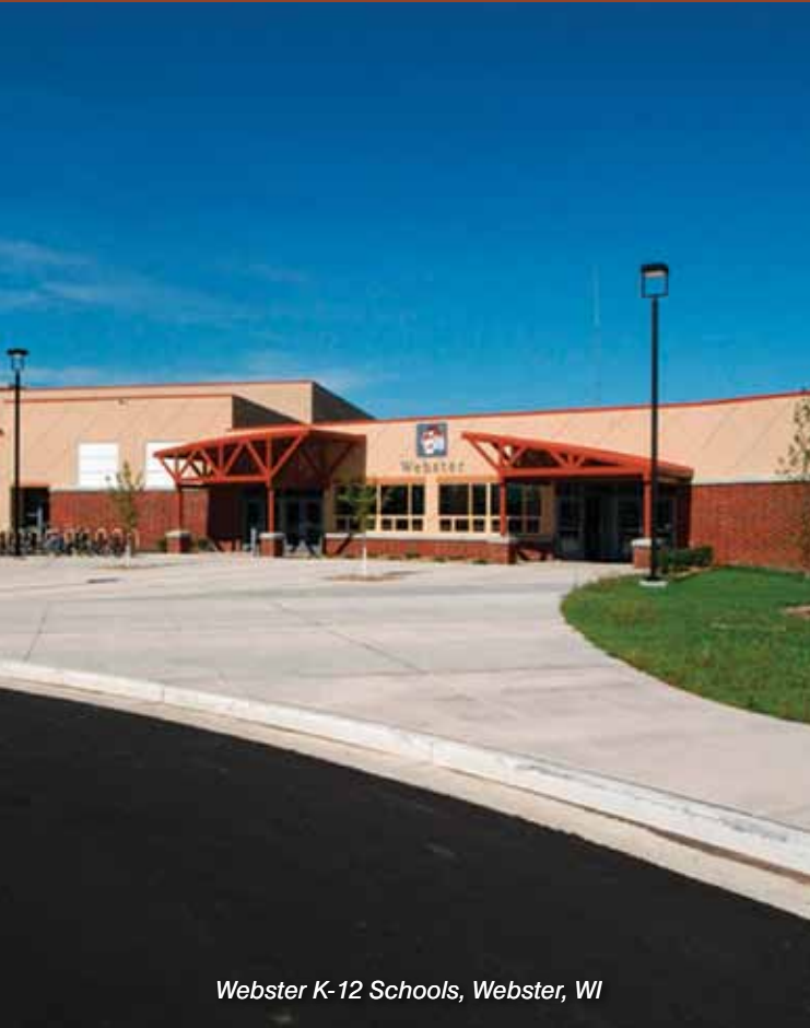
Webster K-12 Schools, Webster, WI