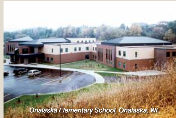
Onalaska Elementary School, Onalaska, WI