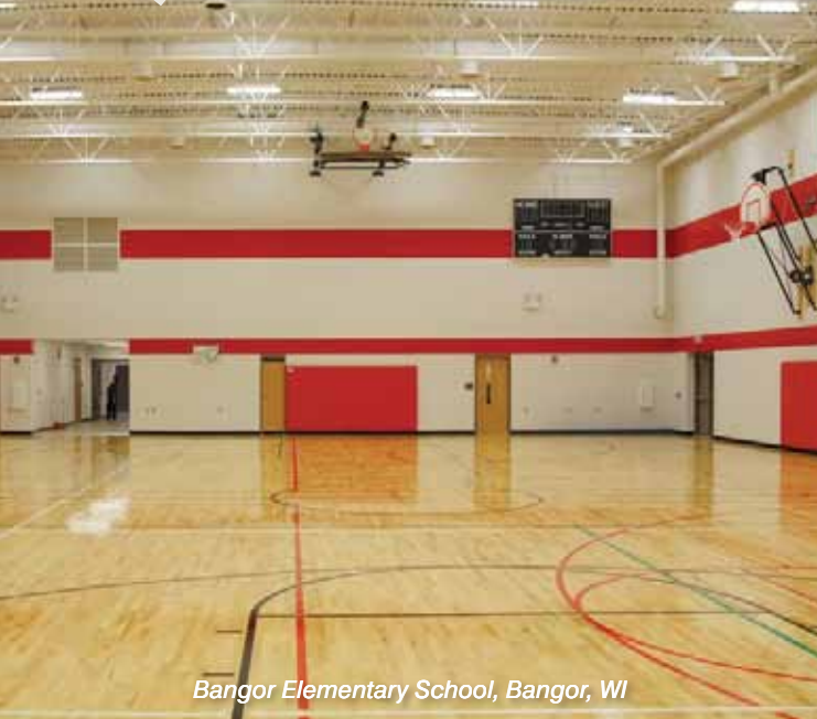
Bangor Elementary School, Bangor, WI