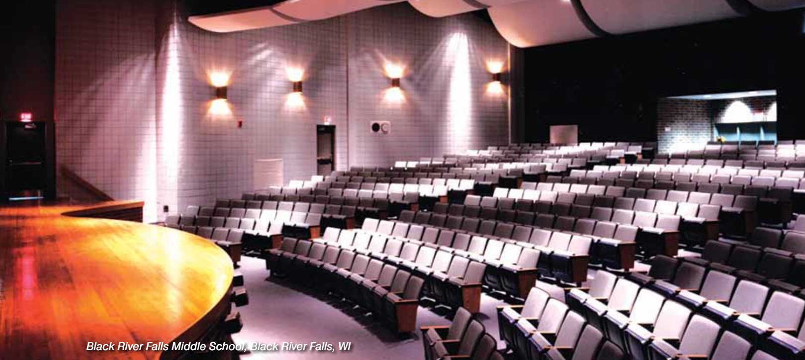
Black River Falls Middle School, Black River Falls, WI