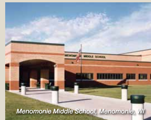
Menomonie Middle School, Menomonie, WI