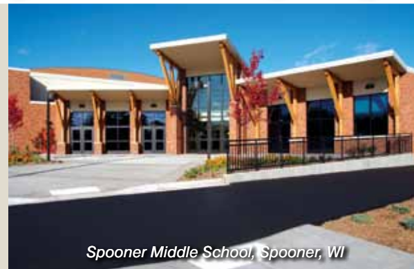
Spooner Middle School, Spooner, WI